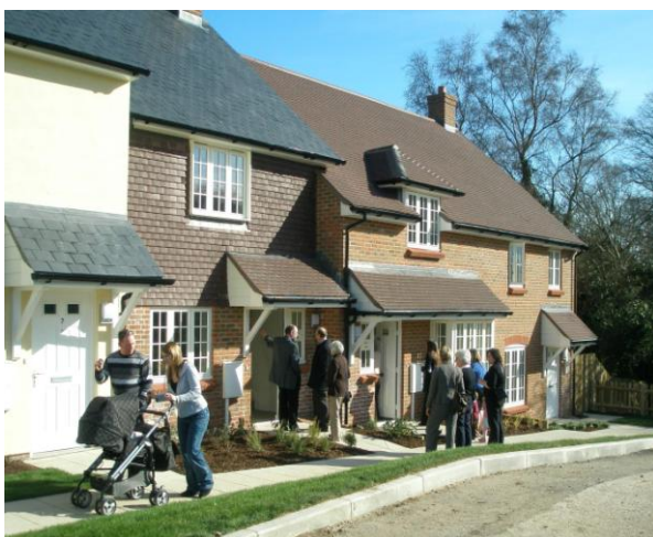
English Rural Housing Association

Engaging early, consulting on potential sites, initial proposals and building design and quality in an open and transparent manner will help to build trust amongst local residents and a feeling that they are part of the process and not having development "done to them".