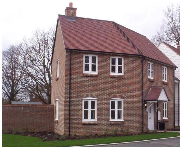
English Rural Housing Association

Whilst it is not realistic to try and set a standard value for exception site land, there is a need to avoid escalating land values so that development of rural affordable local needs housing schemes does not become unaffordable.