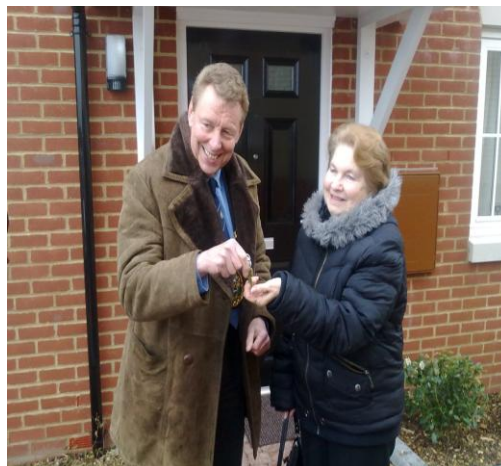
English Rural Housing Association