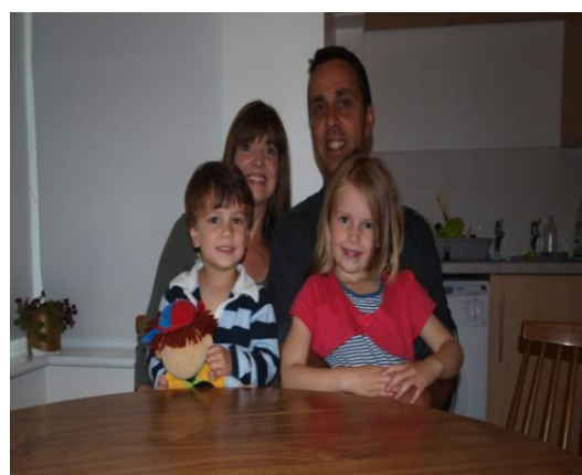
English Rural Housing Association

Affordable local needs homes are provided by Registered Providers and most are either rented or shared ownership, where the occupier part-buys and part-rents the property.