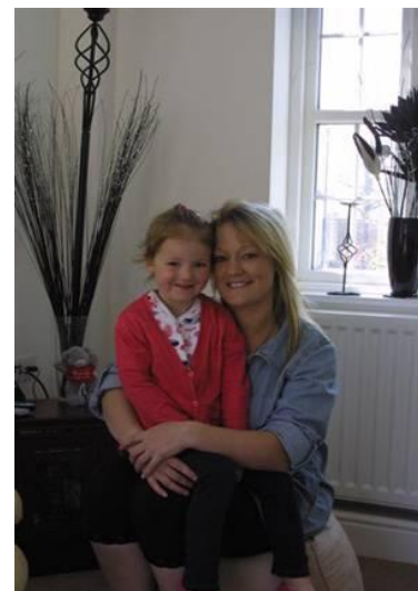
Ashford Borough Council

Once an application has been received for an affordable home, the Parish Council should be consulted on and provide information to the local housing authority or the Registered Provider verifying an applicant’s local connection.