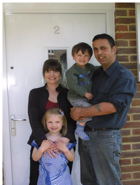
Ashford Borough Council