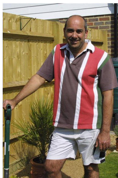
Ashford Borough Council