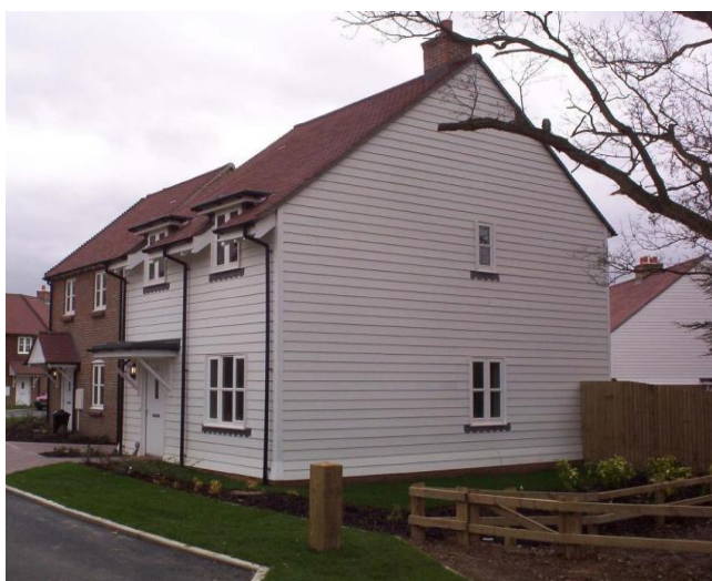
English Rural Housing Association