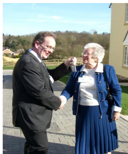
English Rural Housing Association