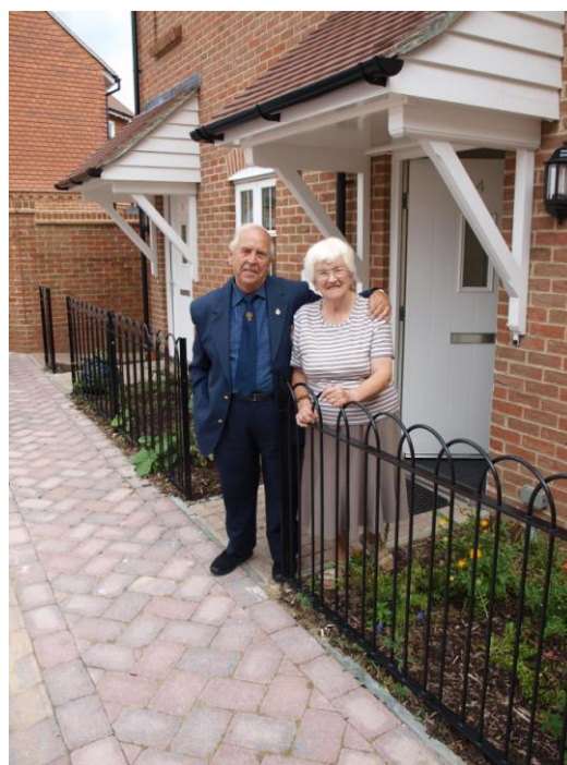
English Rural Housing Association

This information is normally collected through a Housing Needs Survey. A suggested example is attached at Annex B , although the exact questions to be answered will be determined at a local level. Some local housing authorities facilitate a rolling programme of surveys to keep such information current and up-to-date. In Ashford, for example, the local housing authority decided to undertake a refresh of a Housing Needs Survey when a proposed development was challenged, to prove that there was still a current need for the new homes that development would provide.