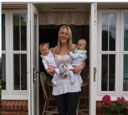
English Rural Housing Association